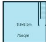
UNAPPROVED FIRST FLOOR MEZZANINE

Schedule for 2 Binary Street, Yatala Warehouse: 568sqm* Office & Amenities: 39sqm* Total: 607sqm*