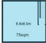
UNAPPROVED FIRST FLOOR MEZZANINE

Schedule for 2 Binary Street, Yatala Warehouse: 568sqm* Office & Amenities: 39sqm* Total: 607sqm*