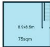
UNAPPROVED FIRST FLOOR MEZZANINE